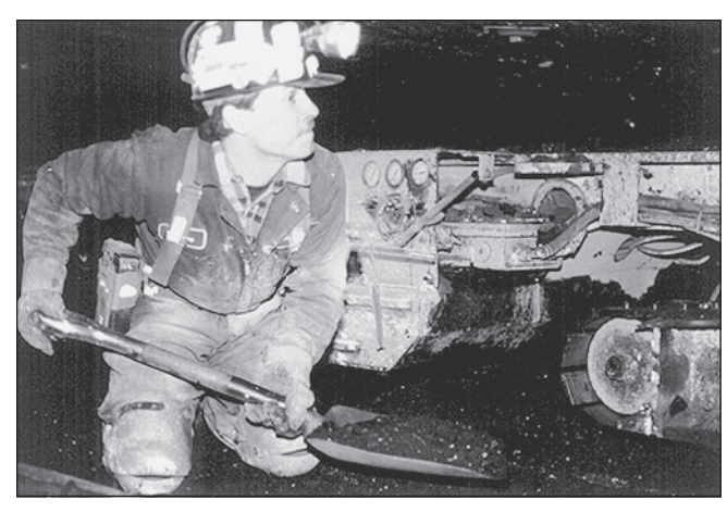
A modern coal miner kneeling to work in the Sterling Mining Company Sterling mine. Although today's underground coal mines are highly mechanized and automated through computers, a significant amount of work is done by hand just as it was in Ohio mines more than 100 years ago (from Crowell, 1995, p. 66).

Since 1970, Ohio's annual coal production has declined nearly 59 percent to its present (2003) level of 22.3 million tons. This drop in production is, to a lesser extent, due to the increasing regulation of surface-mine activity, reclamation, and health and safety issues, but is primarily the result of the Federal Clean