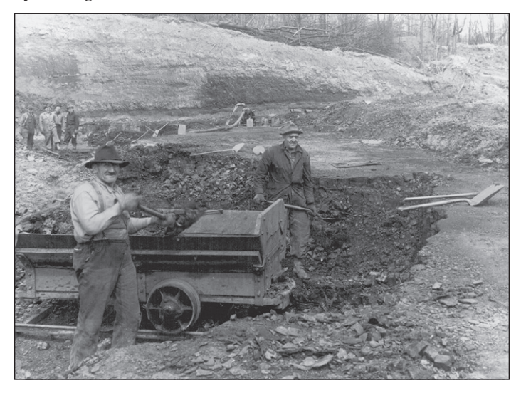
Early surface mining consisted of extracting coal that was exposed along a hillside, using picks and shovels (from Crowell, 1995, p. 18).

The first account of surface mining of coal in Ohio was from a ravine near Tallmadge, Summit County, in 1810. Early surface mining in Ohio consisted of mining coal that was exposed along hillsides, using picks and shovels and in some cases horse-drawn scrapers. The coal and cover material was excavated back into the hillside, perhaps 10 feet or more, until removal of the cover was too impractical or difficult. At this point, the coal was mined by underground methods.