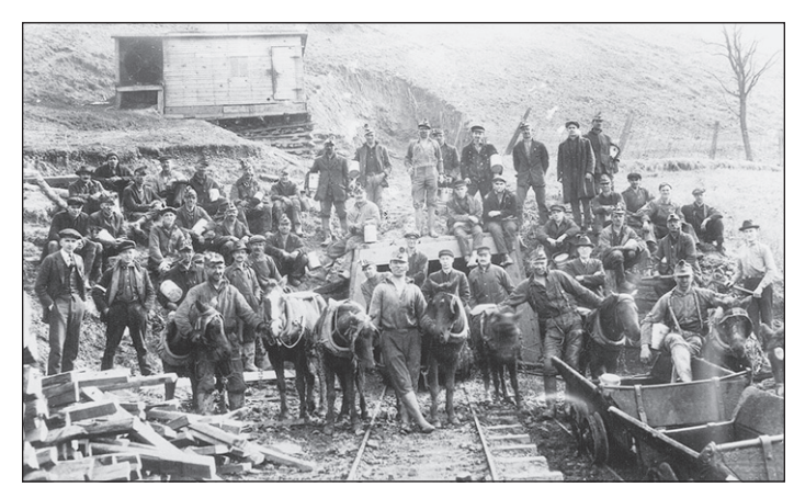
Mules, horses, oxen, goats, and dogs were used to haul coal in Ohio coal mines in the 19th and early 20th centuries (from Crowell, 1995, p. 68).

From 1800 to about 1948, most of Ohio's coal was mined underground. During most of the 19th century, coal was mined by